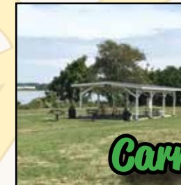
Carr Point Rec Area